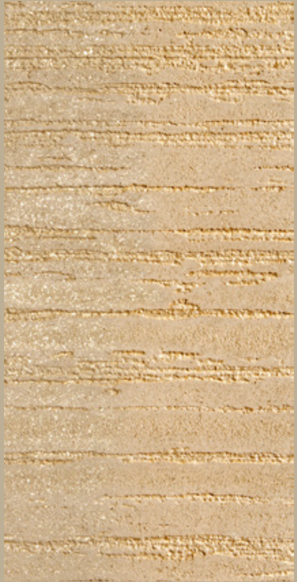
MARMUR FINE 15027 & CERA GOLDMICA