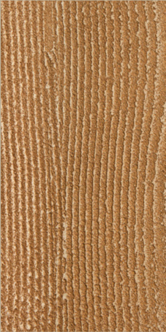
CALCECRUDA 17023 & CERA BRONZE